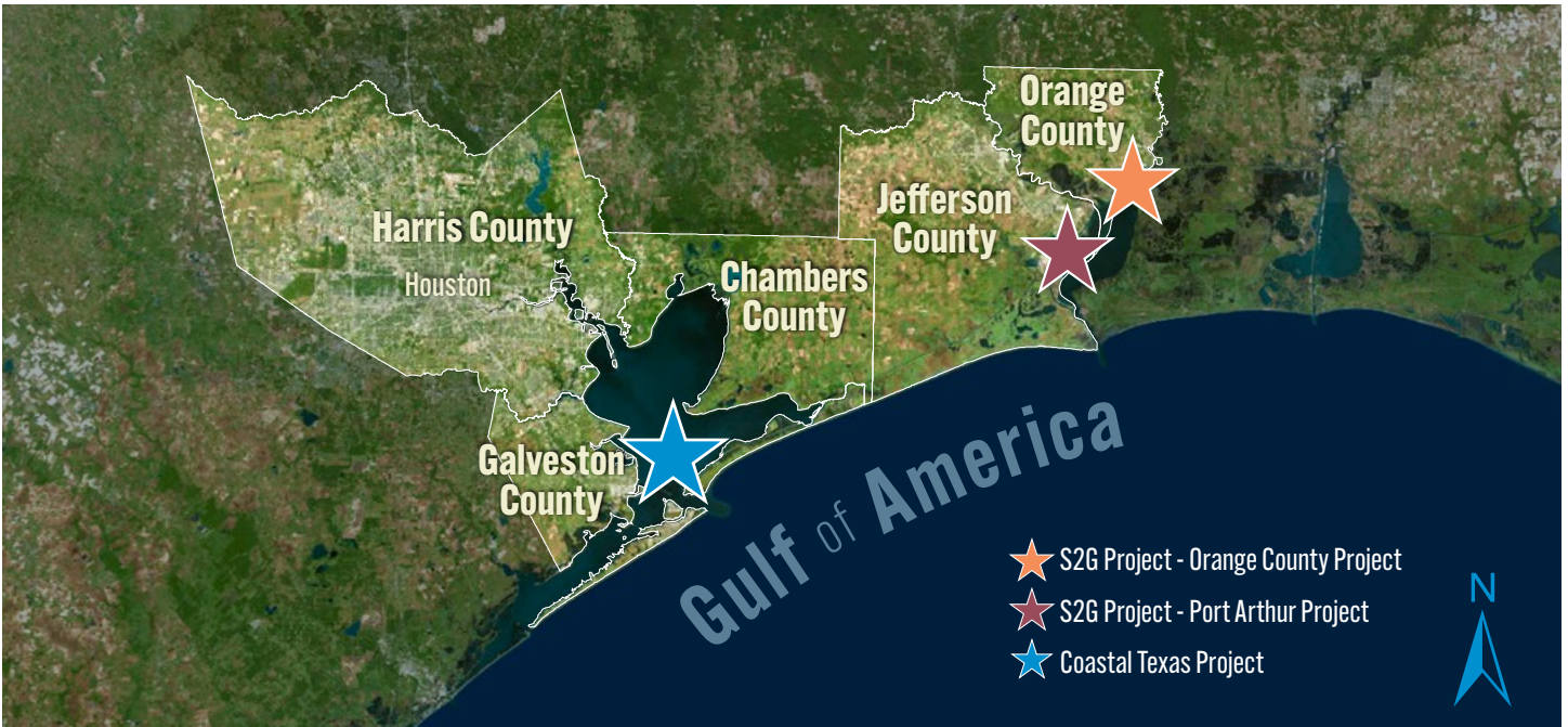
GCPD Territory and Location of GCPD Projects