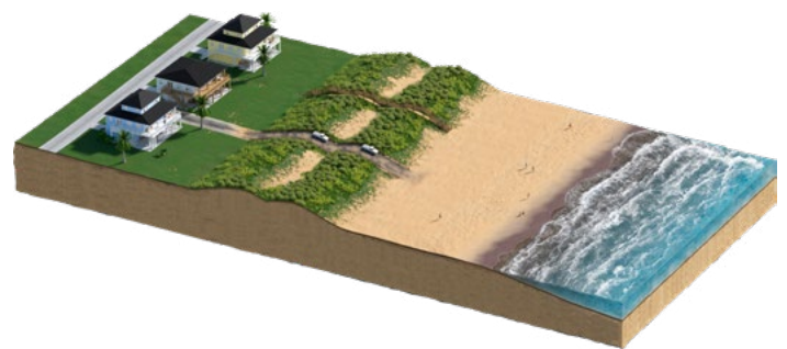
A rendering of the proposed Coastal Texas Project's beach and dune system

On August 1, 2024, the U.S. Army Corps of Engineers (USACE) and the Gulf Coast Protection District (GCPD) signed a Design Agreement to partner on the design of the Coastal Texas Project, specifically the Galveston Bay Storm Surge Barrier System and Ecosystem Restoration feature G-28. Ecosystem Restoration feature G-28 includes shoreline and island protection along the Gulf Intercoastal Waterway on Bolivar Peninsula the north shore of West Bay. In signing the Design Agreement, the GCPD formally takes on the role of non-Federal sponsor for the design of these specific features and will be responsible for providing 35% of all design costs. Learn more here.